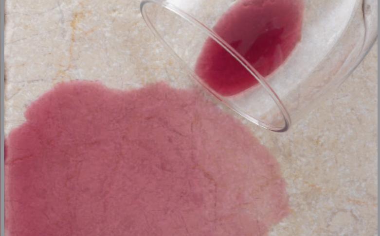
FORMULA 131 SEALED STONE

Etching and staining occurs after 3 minutes