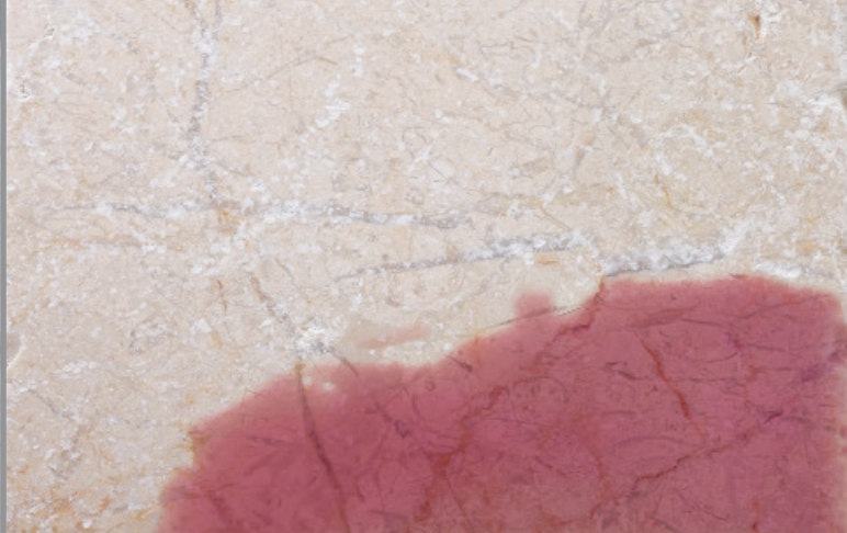
COMPETITOR SEALED STONE

Etching and staining occurs after 3 minutes